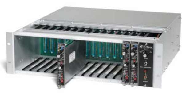
Model R513-16 Sixteen-channel Enclosure

The Model 560H is a versatile, differential dc amplifier with excellent accuracy (0.1%), stability (1 \mu V/°C), frequency response (dc to 200 kHz), and reliability. Its characteristics enable it to be used as a general-purpose amplifier, but its performance allows it to be popular as a dedicated, high-accuracy data-collection amplifier.