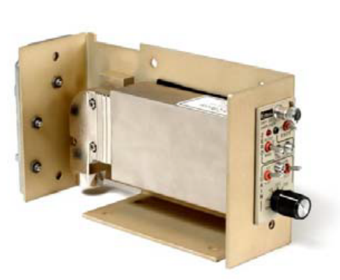
Model E408-1D Single-unit Mount, including DIN-rail adapter